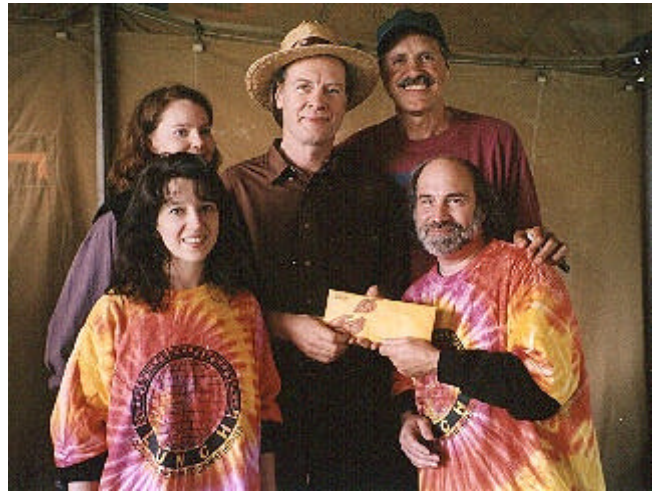
There Are More Than 80,000 Hungry Children under the age of 12 In Connecticut