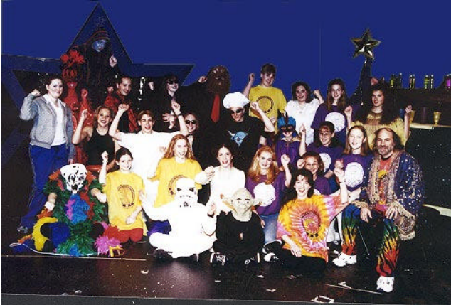
The 5th Harry Chapin Legacy Show at Stonington High School