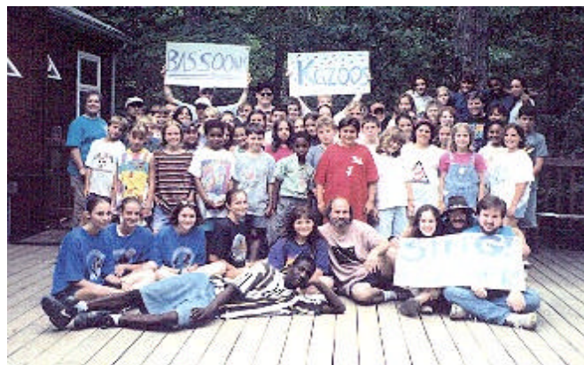
Summer Music Camp at Camp Wightman

You can E-mail us at wdpsons@aol.com . We're always happy to hear from you and we always write back.