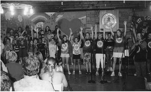
The 2001 LUNCH Summer Camp at Camp Wightman