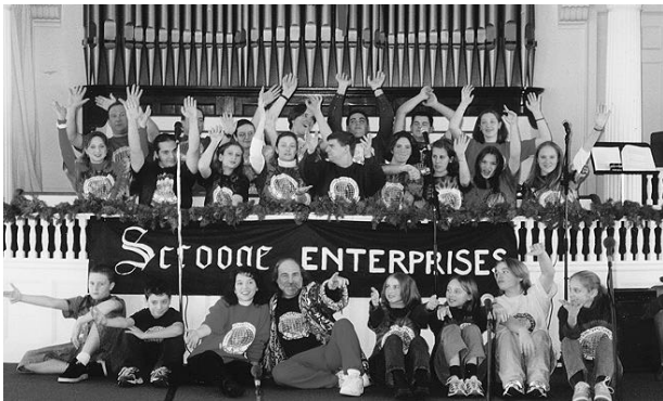
The 2000 LUNCH Holiday Show "A Dilbert Christmas"