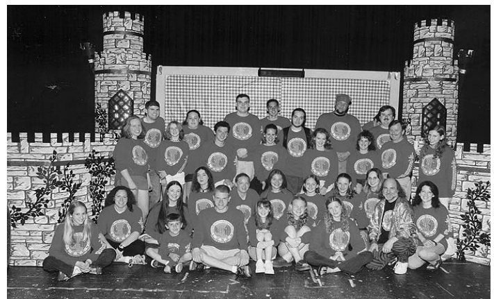
The 6th Chapin Legacy Show -- "Excalibur", May, 2001, Stonington

In light of the recent events of September 11, we are making a special effort to assist with the relief efforts there as well, but we do not in any way want to compromise our support of the many local agencies who serve the needy people of our local communities. Hunger and poverty remain as a root cause of violence in a society, and now more than ever, it is important to address the causes of violence. We remain committed to our primary goal of helping local social service agencies. See the enclosed sponsor sheet to see how you can help.